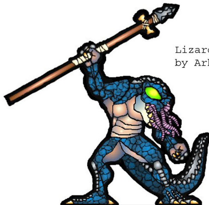
Lizard Men Modded by Arkcaver