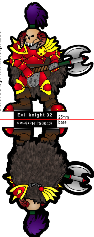
Evil knight 02